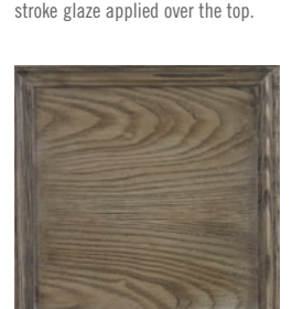
A5: Smoke Ash Sandblasted 79: Stone (L) (L)** Semi-opaque greige finish with sand blasting technique to create wood character.**AVAILABLE ON ASH & OAK SANDBLASTED ITEMS ONLY.