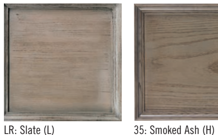
Semi-opaque greige finish.