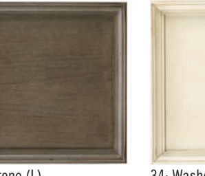
Very clean grey-beige finish that reads through to the beauty of the