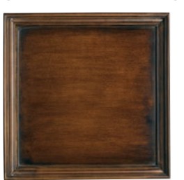
LC: Antique Walnut (M) A rich clear, dark brown finish with reddish undertones reminiscent of the color of a dark acorn.