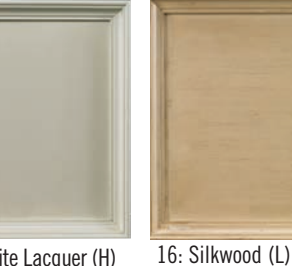
A very artistic tawny beige finish A multi-step finish starting with a that has been very lightly spattered medium brown finish, then overlaid with moderate read-through to the with a grey-beige secondary finish. wood grain.