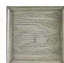
N6: Earth Grey (L) Casual light grey hues with a dry antique vintage character.