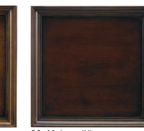
F4: Gold (L) 13: Lancaster (H) A gold paint with a glazed Medium brown high sheen finish appearance to emulate the beauty with hand applied burnishing and appearance of gold leafing. reminiscent of a well cared for 19th century antique.