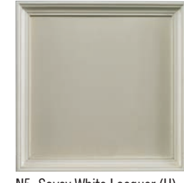
N5: Savoy White Lacquer (H) High gloss white lacquer, clean modern character.