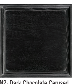
N2: Dark Chocolate Cerused 21: Dove (L) (L)** Accentuated with white cerusing. Light sandblasting enhances the wood grain.**AVAILABLE a gently spattered antique glaze. ON ASH & OAK SANDBLASTED ITEMS ONLY.