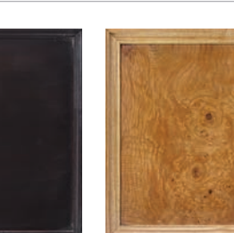
Q1: Black Tie Lacquer (H) A deep nickel-colored paint finish A multi-step blending of slightly textured black lacquered tones with subtle sienna undertones.