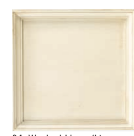
34: Washed Linen (L)